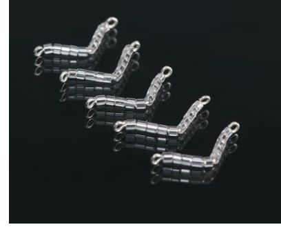
Step 3: Connect the eyes on 5 eye pins. You can modify the way the eyes are turned using the flat nosed pliers. String the eyes and then add 1x TC between them. Connect both sides. Twist the outer eyes so that they are facing the same way.