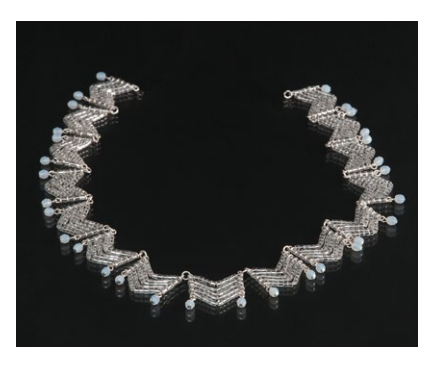
Step 6: Connect a carabiner and 20 cm of adjusting chain to the outer links. Twist the chain in half and connect both ends in the outer eyes.