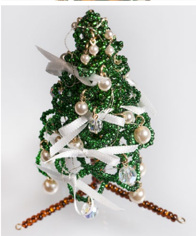
Design by Helena Chmelíková

PRECIOSA Rocailles 331 29 001; 10/0; 6/0