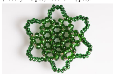
Step 4: Levels 7 & 8 Use the entire Level 5 as a base. Add new loops to the tops of the existing loops with R10 (Level 7 - 14 pcs, Level 8 - 18 pcs).