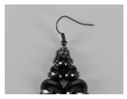
Make the second earring.