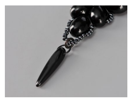
Step 6: Hang the entire earring on an earring hook.

Step 5: Hang 1x Th from the loop of Ch using a thin ring and a 4 mm ring.