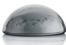
40003 smoke grey