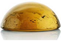
10513 golden smoke