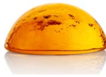
10033 golden topaz